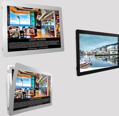
SLIMLINE 10mm thick